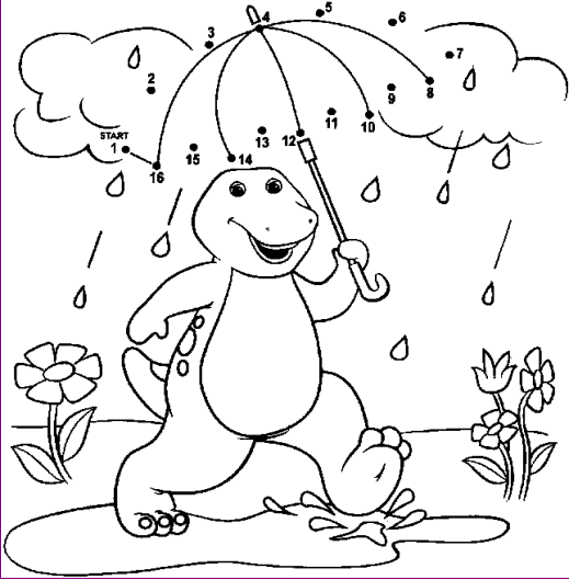
Join up the Dots